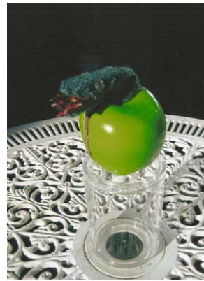
Adam and Eve, Mali.

As far as the recession is concerned, Mali feels that the art world is un-affected by Recession. Many art lovers are still queuing up to buy art work. They may not all be the art lovers as some of them see art is a very good investment.